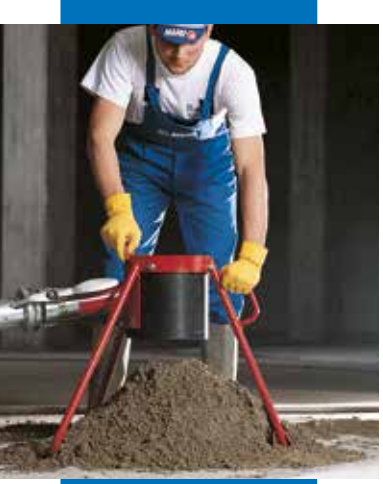
Batching a Topcem mix

will compact to produce a closed and smooth surface without water bleed.