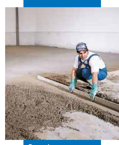
Preparing a levelling strip