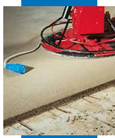
Power floating the surface of a Topcem screed