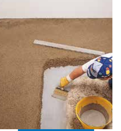
Spreading the anchoring slurry for bonded Topcem screeds