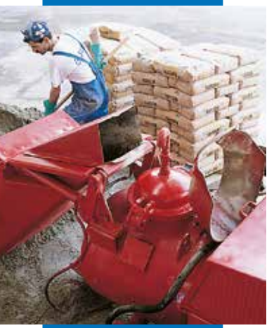
Mixing Topcem with an automatic pumping