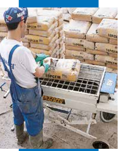
Mixing Topcem in a mini-batcher